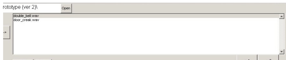
Fig. 2. Top portion of the first interactive prototype. This was moved and its functionality was modified due to expert feedback

The first interactive interface was evaluated with a think aloud protocol, which was possible and appropriate due to the relatively sparse nature of the auditory display. Additionally, the participants needed little, if any, guidance after the initial instructions. These sessions produced significant feedback about the interaction and layout of the interface, as well as the particular way that the system would play the audio.