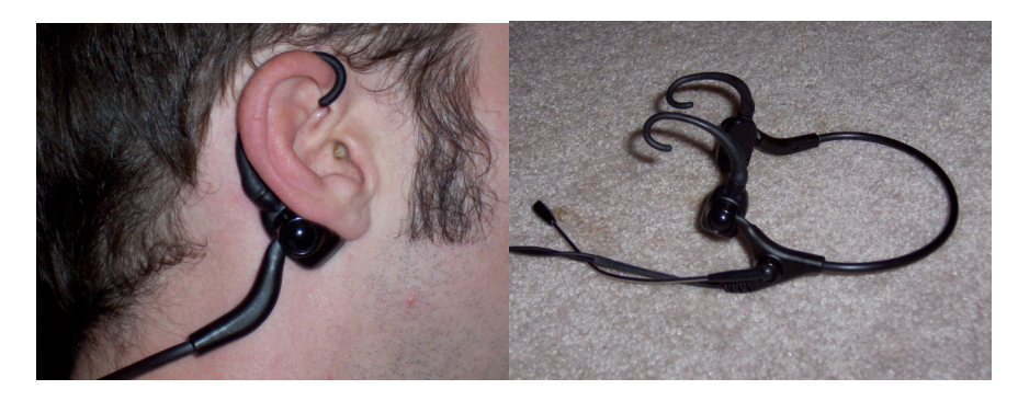
Fig. 2. Bonephones support auditory display and simultaneous processing of ambient cues

if small) are also unacceptable for reasons of privacy and user-acceptance. For this reason we have had to consider display alternatives such as bone conduction headsets that can provide private audio for the primary task while not impacting too much the secondary task. Certainly, with the use of bone conduction, the nature of the audio output needs to be reconsidered for audibility, quality, etc. [11-13].