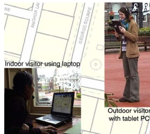
Figure 2: A co-visit with one user physically in the George Square using a tablet PC and one indoors visitor using a laptop to share the visit.

We ran a trial with 20 participants, in pairs of two, recruited as pairs of friends. We chose a mix of locals (10) and visitors (10) to the city, recruiting participants through the city’s tourist information centre, language schools and our university. Ages ranged from 19 to 35, with 13 female and 7 male participants. Participants were paid for their time at the end of the visit. Each trial lasted between 35 and 60 minutes, with a post-trial debriefing of 10 minutes.