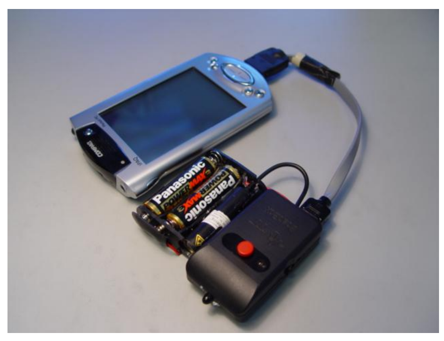
Fig. 2. The physical browser components: iPAQ (left), central SoapBox (right) and a laser beam unit (middle). The SoapBox has a pointing button (shown in the middle of the SoapBox) to activate the laser unit and the IR transmitter (visible in front of the SoapBox)

The PDA has a lightweight personal HTTP server [6], which supports servlets. The HomePageServlet is used to construct and provide a dynamic home page of available links when scanning, or when multiple tags are selected. The TagReader engine communicates via the SoapBox driver unit with the Java serial port driver for the PocketPC. If a unique tag (containing the URL) is selected, the TagReader engine invokes the default browser of iPAQ with the specific web resource (the URL) as an argument. When presenting multiple links, the engine launches the web browser with the URL of the local HomePageServlet as an argument. The user then selects the proper link from the PDA GUI, or tries to select a tag again by touching or pointing.